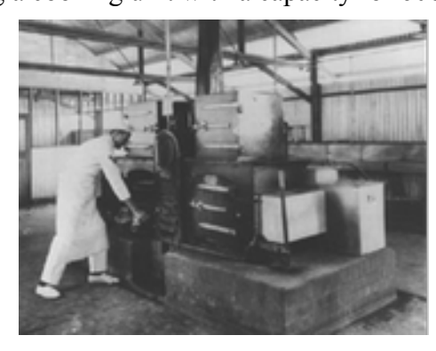
The Stationary Unit

Sir Stanton's inspection of this horrified him. He discussed with us the possibility of developing and installing a cooking unit with a capacity for 600 men.