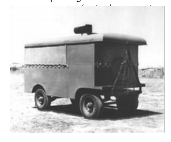
The Senior Cooker

The demand was so great that mobile units were placed where they served an urgent need. They were used on rail transport where it was carried by truck to feeding points, beach heads, in sea transport where it was lashed on deck, in field hospitals, trans-shipment points and dock operating units.